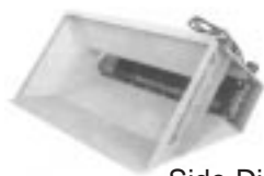
Side Discharge Buckets